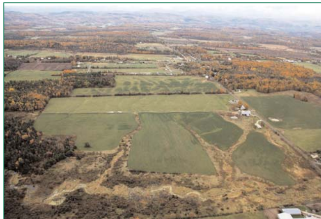
Recently conserved Nordic Holstein (former Bean) Farm as seen from the air.

Outreach and education continue to be key objectives for CLT. We believe that our work should coordinate well with Town goals for the future of Charlotte. To that end we have participated in projects where our work and the Town's intersect, such as the recent sewer service area discussion in the village and planning for a Town trail system. We also began discussions with the Conservation Commission on a long-term conservation effort for an area of highly important wildlife habitat.