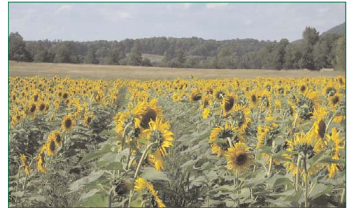
A new crop of sunflowers, on conserved land, brightens the drive along Route 7 just north of State Park Rd.

Helping to Protect and Preserve the Rural, Agricultural Landscape of Charlotte