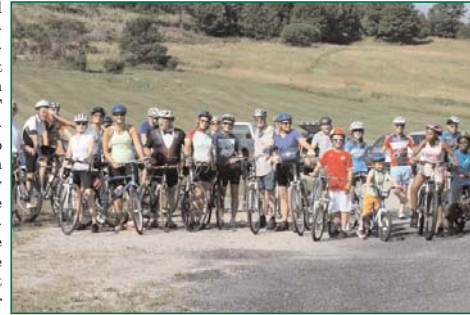
Enthusiastic bikers line up before the July bike ride to tour some local farms and conserved land.