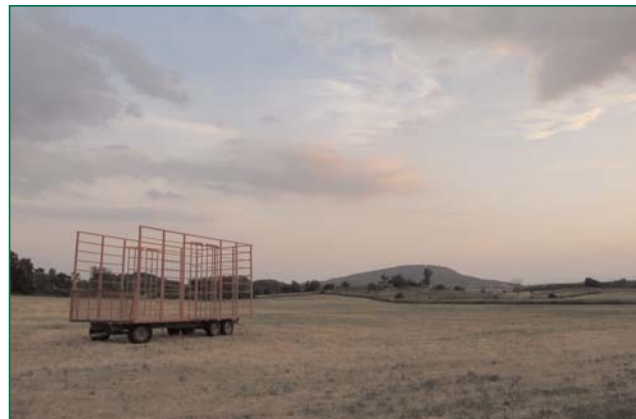
Hay wagon at sunset on land recently conserved at the Nichols farm.