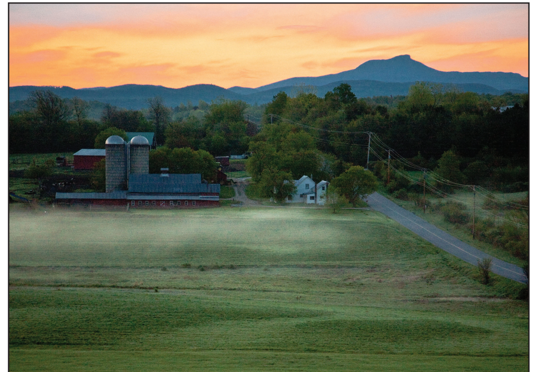
Early morning view of Camel's Hump with conserved land on the Philo Ridge Farm in the foreground

Helping to Protect and Preserve the Rural, Agricultural Landscape of Charlotte