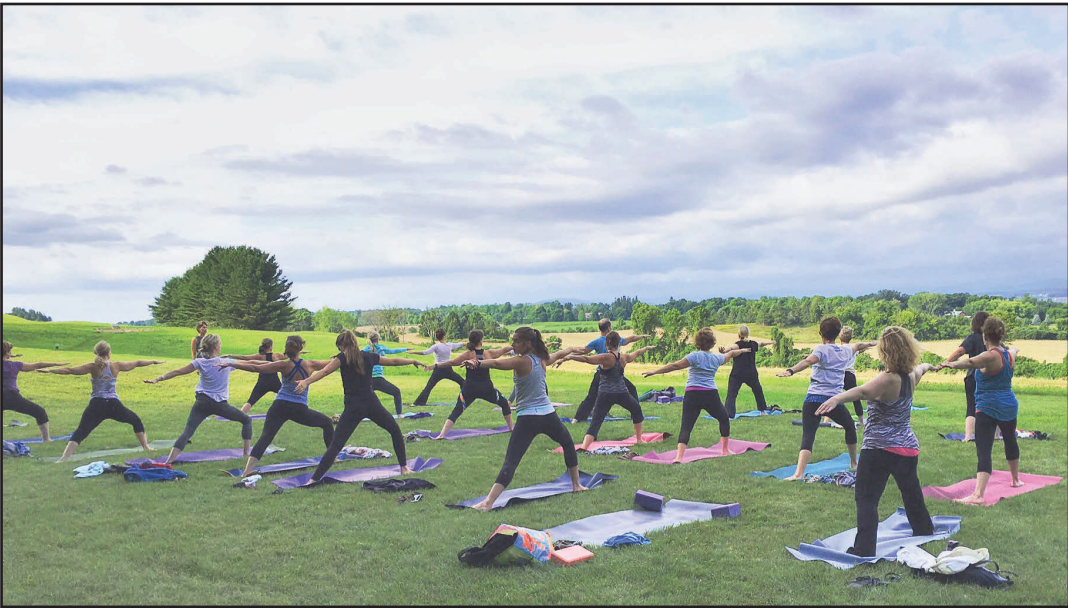
Many thanks to Yoga Roots and Adam's Berry Farm for hosting yoga classes at the farm last summer. Yoga Roots generously donated a portion of the entrance fee to benefit the work of CLT. Adam's Berry Farm is a property conserved with the support of many Charlotters and has been a wonderful addition to town. The classes were fun and located in a gorgeous setting!